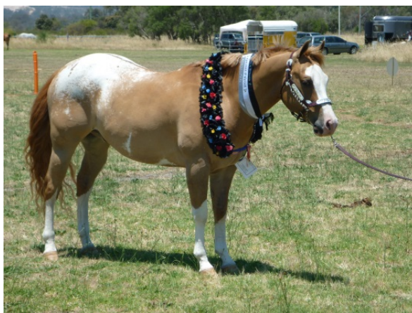
Awesome storm 2 years old