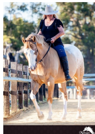
Awesome 10 years old