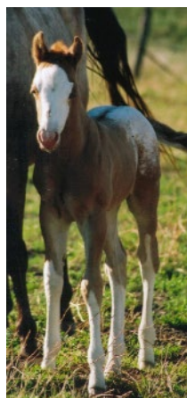
Awesome storm 2 days old

Halter training, weanling/yearlings, any age for the best foundation you can give your favourite fur baby.